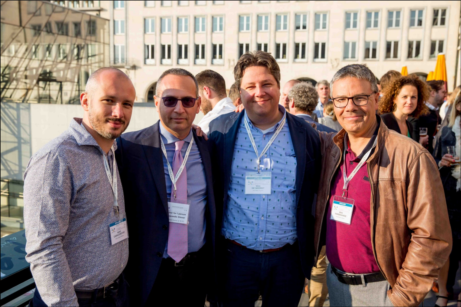
At the end of the day the BOTA team got together at the Congress Dinner